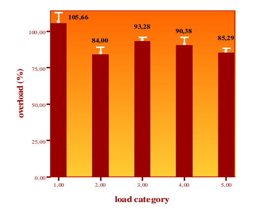
Figure 2. Distribution of offences between Hauled Goods Category